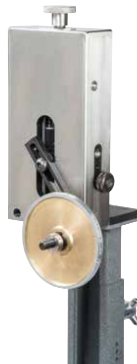
Shown with IE-3 (18" circumference) indent wheel