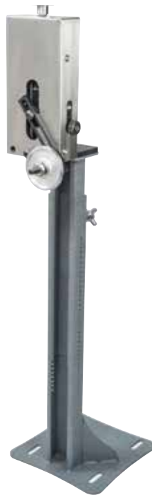
Shown with IE-1 (12" circumference) indent wheel