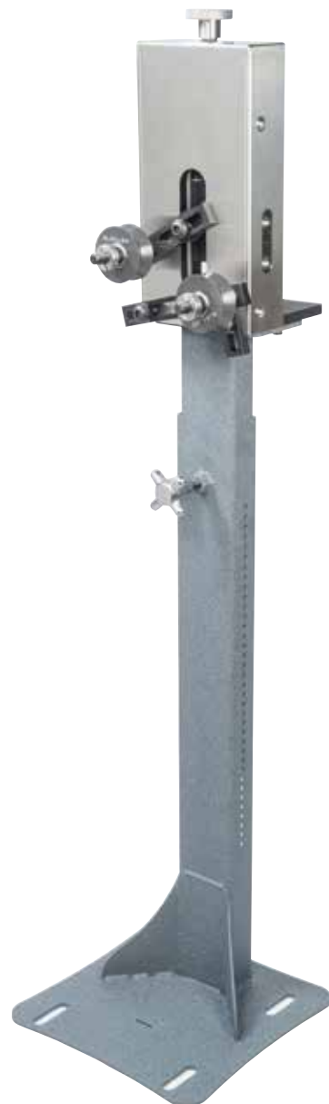
S-GRA Series II shown with low profile height adjustable stand