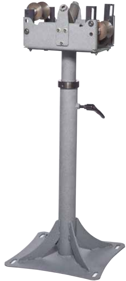
S-GRA Series III shown with heavy duty height adjustable stand