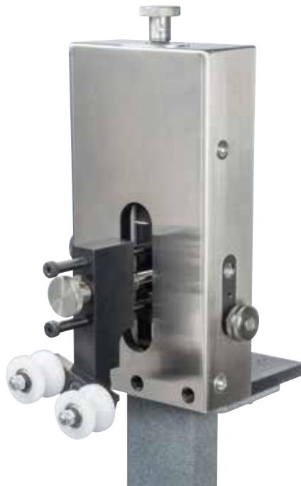
S-GRA Series I shown with UHMW guide rollers

Dual guide roller assembly mounted on precision X/Y positioning fixture for guiding small product diameters up to ½" (12,7 mm). Available with either stainless steel or UHMW guide rollers.