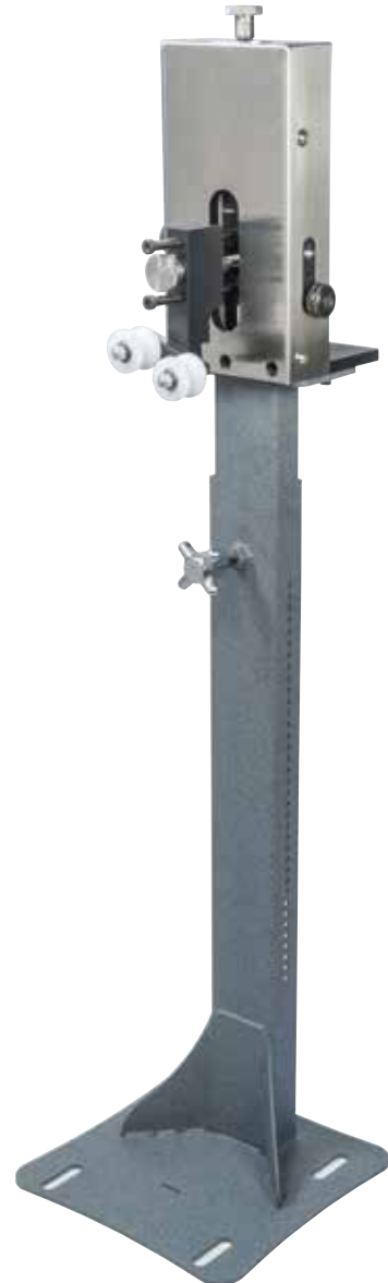
S-GRA Series I shown with low profile height adjustable stand