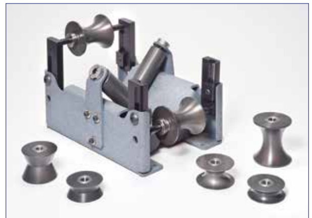
S-GRA Series III shown with available guide rollers