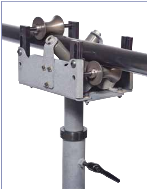
S-GRA Series III shown guiding 3" diameter cable

Series III provided with height adjustable stand (S-01-18) for product positioning 34" to 49" (86 mm-124 mm) from floor.