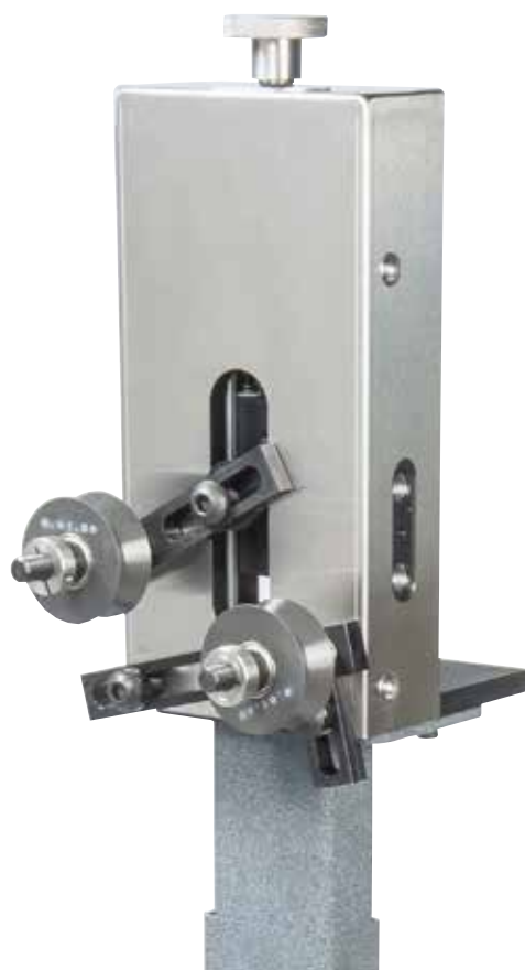
S-GRA Series II shown with S-01-20 "v" guide rollers

Complete series of guide rollers available in flat, "v", and radius sizes.